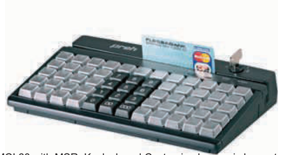
MCI 60 with MSR, Keylock and Customized numeric key set