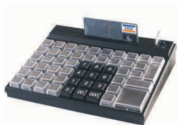
MSI 60 with MSR, Keylock and Customized numeric key set